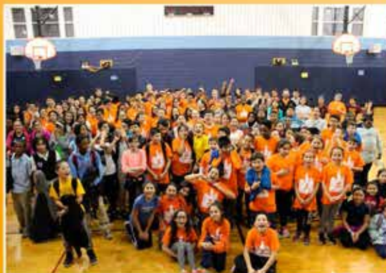
Students came together for their Winter Field Trip, which included Hip Hop Yoga led by Mindful Practices