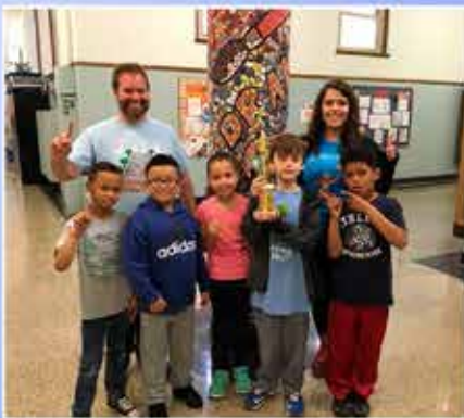
Students from Murphy Elementary won the Snowflake Trophy for maintaining physical activity during the Winter months

"Chicago Run has improved students' self esteem and given them the opportunity to get goals and meet them or even exceed them!" - Chicago Runners school site coordinator