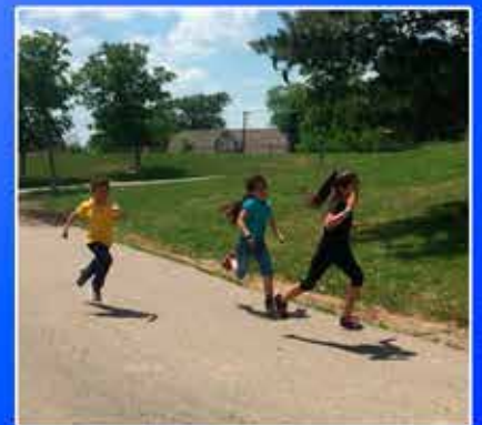
Students at Tonti Elementary participate in their "Olympic Fitness Day"