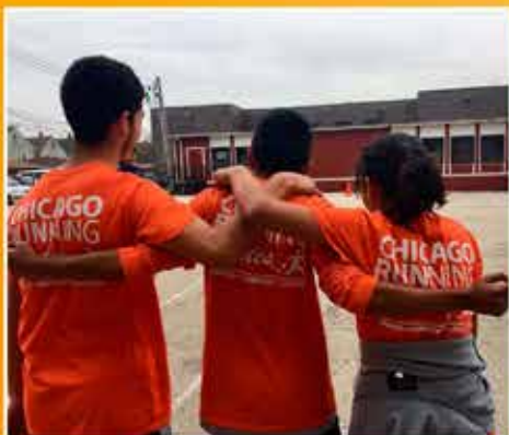
Teammates supporting each other at Eli Whitney Elementary