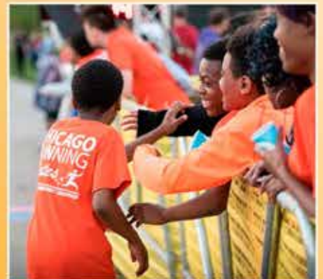
Students encouraging each other at the end of the 4 Mile Classic race

*based on results provided by Up2Us Sports, a national Sports Based Youth Development organization