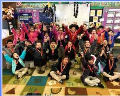
A kindergarten class at McPherson Elementary with marathon medals for running 26.2 miles that year